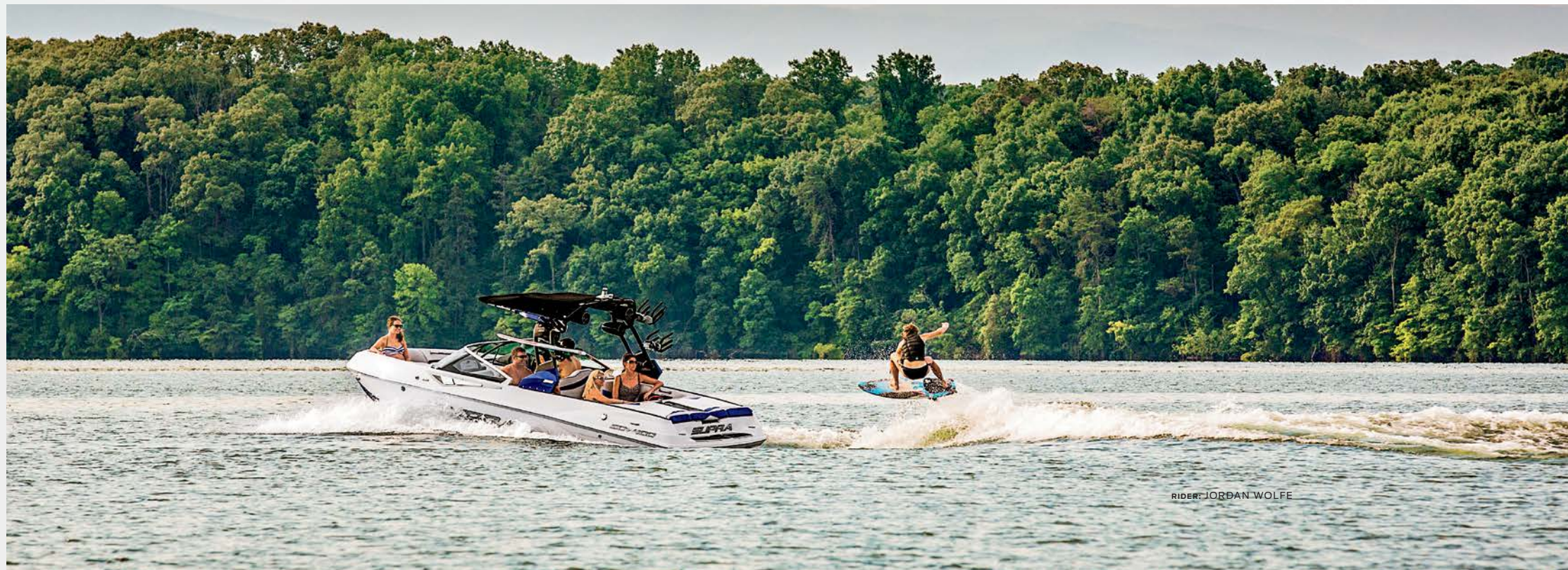
RIDER: JORDAN WOLFE