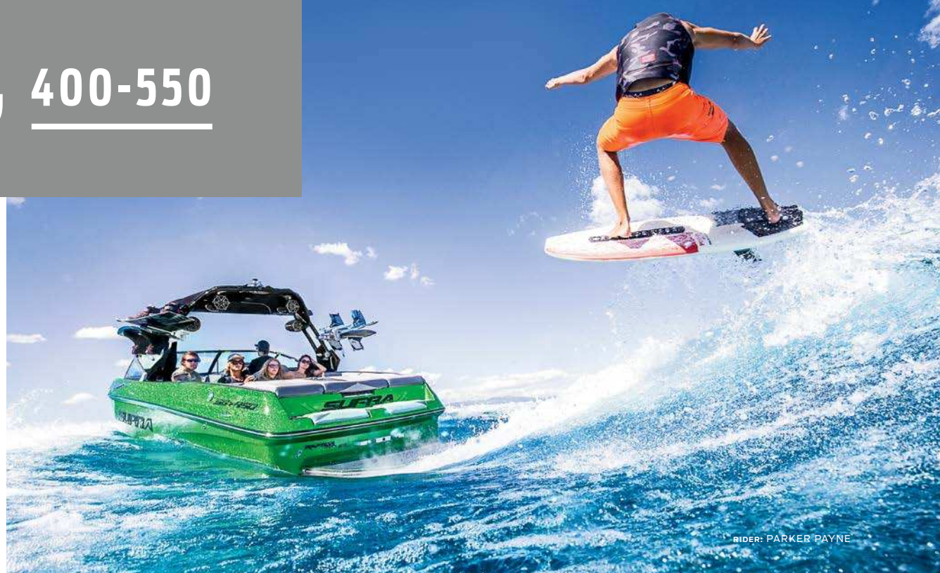
RIDER: PARKER PAYNE

Raptor® by Indmar® 6.2 L 440 Engine ROUSHcharged Raptor® by Indmar® Supercharged 6.2 L 575 Engine Worlds Edition Package Supra™ Swell Surf System 2.0 Integrated Steering Wheel with Wireless Controls And more