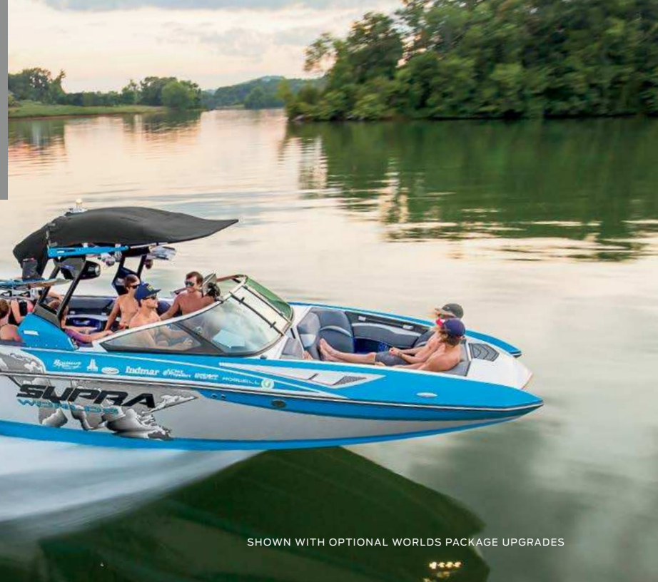
SHOWN WITH OPTIONAL WORLDS PACKAGE UPGRADES