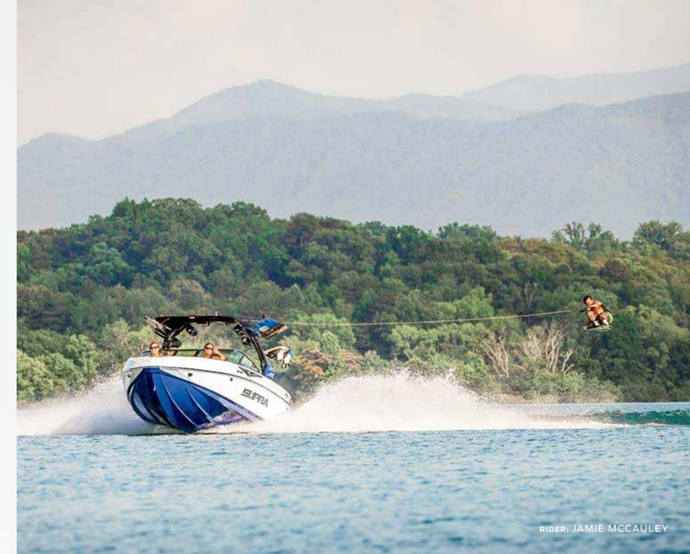
RIDER: JAMIE MCCAULEY

If we could make the time between sunup to sundown longer, we would. What we can do is make every minute on the water more valuable than the next. It comes down to the refined comforts you'll find in every detail of a Supra™. From functional flip seats and storage, to the luxurious billet accented mission control helm, a heated driver seat and high definition sound—Supra™ keeps you in the moment all day long.