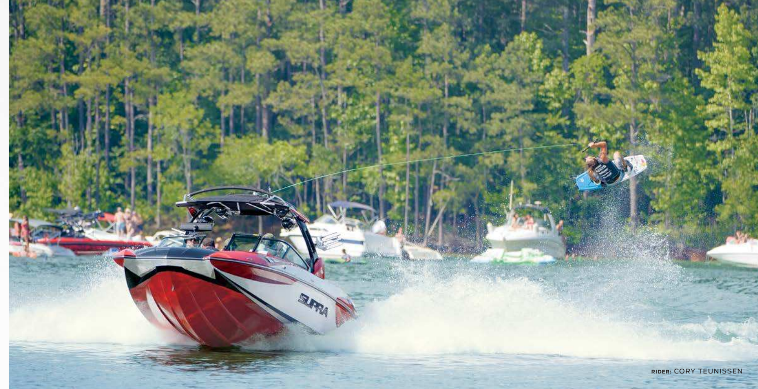
RIDER: CORY TEUNISSEN