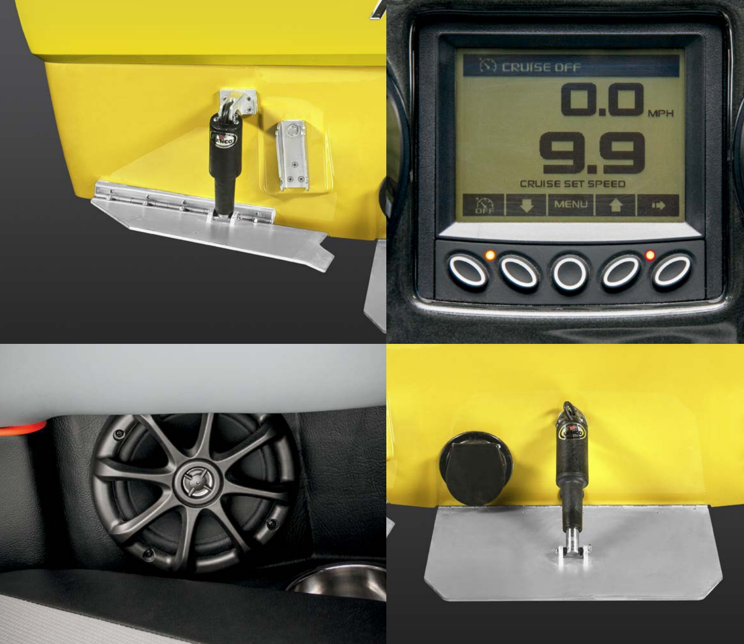
Clockwise from top: 1. Moomba Auto Flow 2.0 Surf System delivers pro-level waves on either side of the boat and switches sides in seconds; 2. Digital Cruise Pro II puts precise speed control at the tips of your fingers; 3. Kicker Marine Audio provides the soundtrack to every great session; 4. Moomba Smart Plate 2.0 is 50% larger for faster planing when the boat is fully loaded.

comfortably behind your vehicle — perfect for both quick day trips and extended weekend getaways. But don't let the Mondo's easy-going size fool you, there's still plenty of room for all your closest riding buddies to stay comfortable all day long.